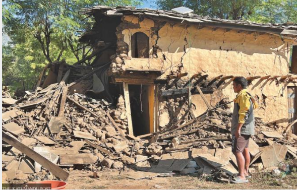
A man inspects the remains of a house destroyed by the quake in Aathbiskot-14 on Saturday.

even though the cold season makes this situation particularly challenging, need to face the difficulties of living outdoors with young children. According to the latest data by MoHA, 937 houses were severely damaged 2954 houses were partially damaged but this data is subject to change as the assessment takes pace. The photo gallery can be accessed in Annex section.