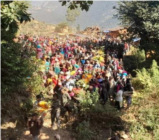
Grieving Families performing final rituals of their lost family members