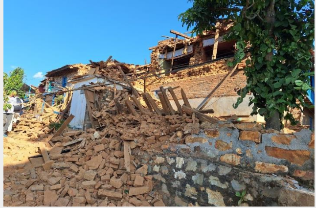
Turbulent Shakes smashed the Houses flat