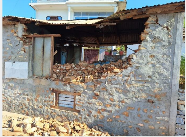
Sufferers grieving while also looking for alternatives to safeguard oneself.