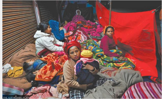
Women and children take shelter in a tent at Khalanga Bazar, Jajarkot on Saturday evening