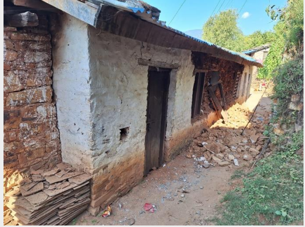
Affected families in need of shelter hoping to receive support soon