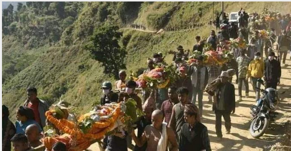
Community performing final rituals of the lost loved ones